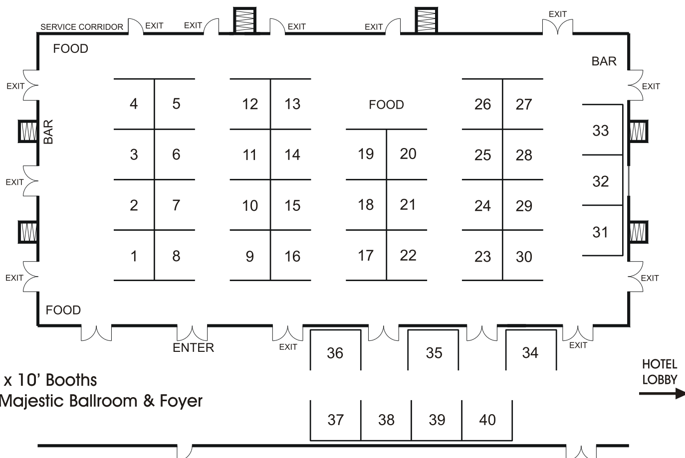
EXHIBIT HALL FLOOR PLAN

40 - 8' x 10' Booths in the Majestic Ballroom & Foyer